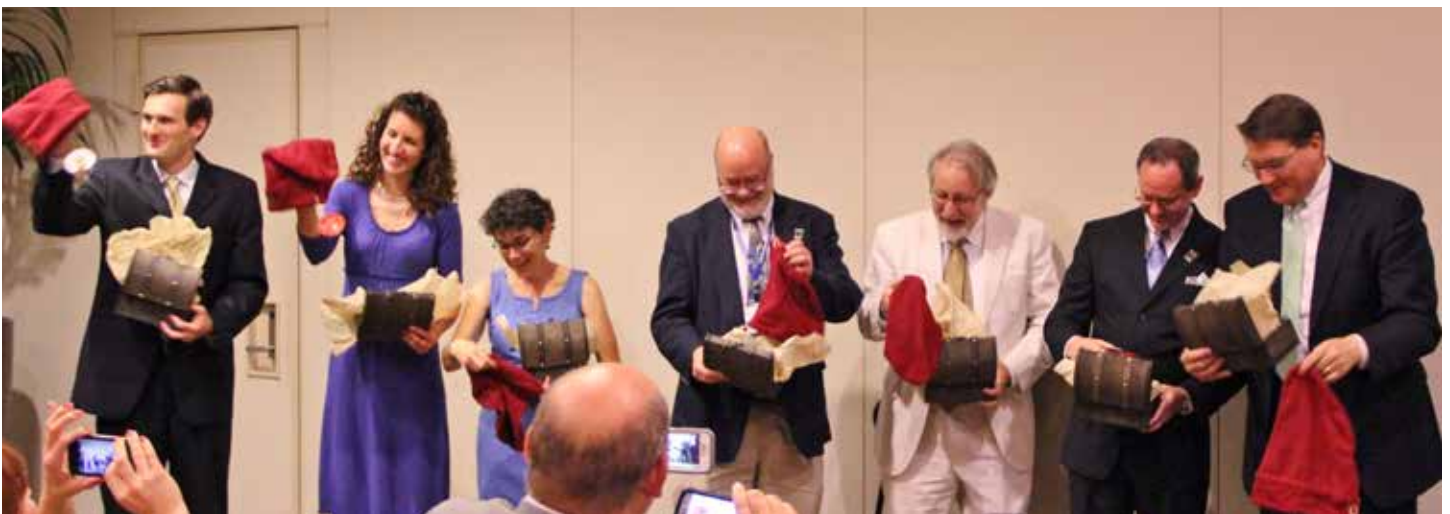
Summer Institute faculty and Foundation staff enjoy their "liberty caps," a gift from the Fellows.